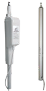
SHEV spindle motor opener including console