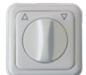
ventilation rotary switch (upon/ under plaster)