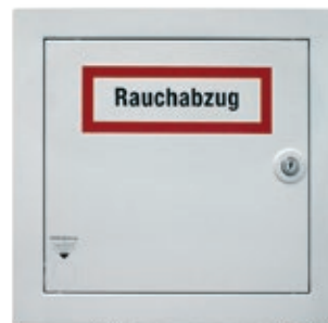
JET-SHEV motor control central including accumulators for backup power supply

Basic configuration JET-TR 24V SHEV set for JET-light dome