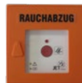
SHEV DIN main release switch