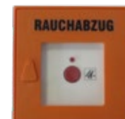
SHEV DIN secondary switch