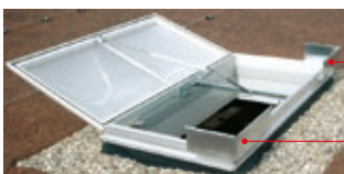
JET-SHEV light dome with wind baffles for an optimized aerodynamic degree of efficiency