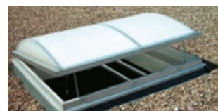
JET-VARIO light flap with SHEV device and electrical motors in ventilation position