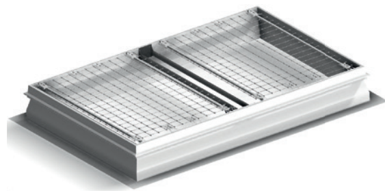
JET LK-DDN for SHEV dome rooflight