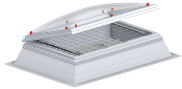
JET LK-DDN, installed on a GRP upstand with dome rooflight, ventable